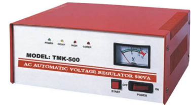
TMK-500 TMK-800 TMK-1000